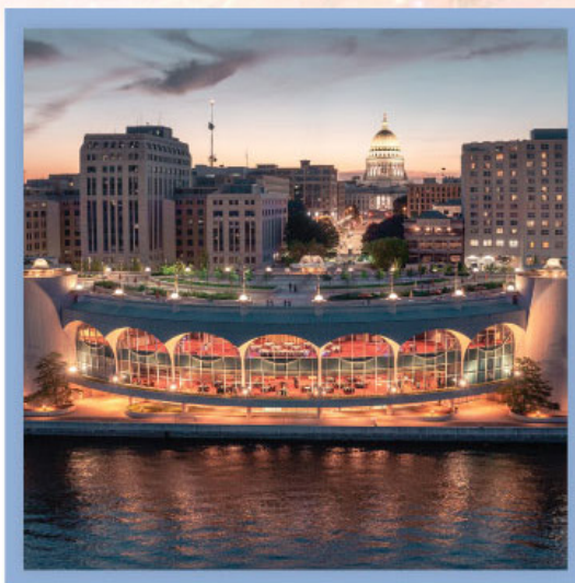
Monona Terrace Community and Convention Center

High-quality workshops, community events, an optional post-conference retreat, and plenty of opportunities to connect in-person and online