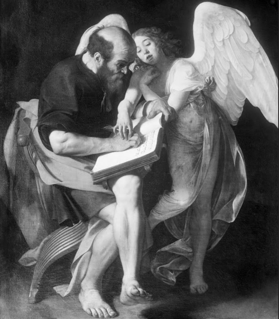
Der hl. Matthäus schreibt sein Evangelium mit Hilfe eines Engels Caravaggio, 1602 Bode-Museum, Staatliche Museen zu Berlin Berlin, Germany

I will paint with words Bring out the light and dark- Chiaroscuro